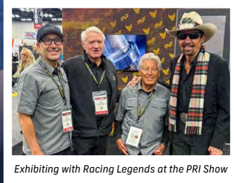
Exhibiting with Racing Legends at the PRI Show