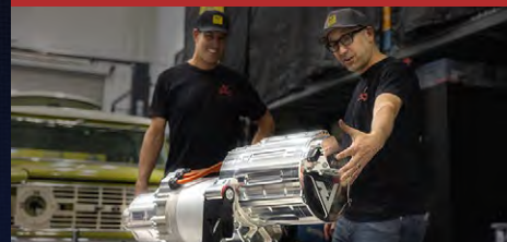
Innovating with EV Partner Revolt Systems