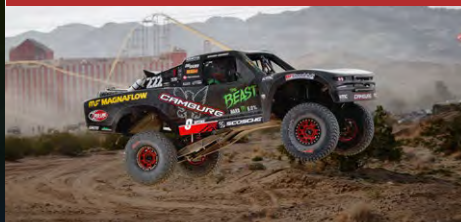
Leading the Camburg Race Team to Victory