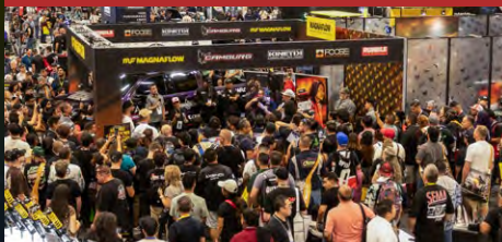
Building SEMA Experiences with MagnaFlow